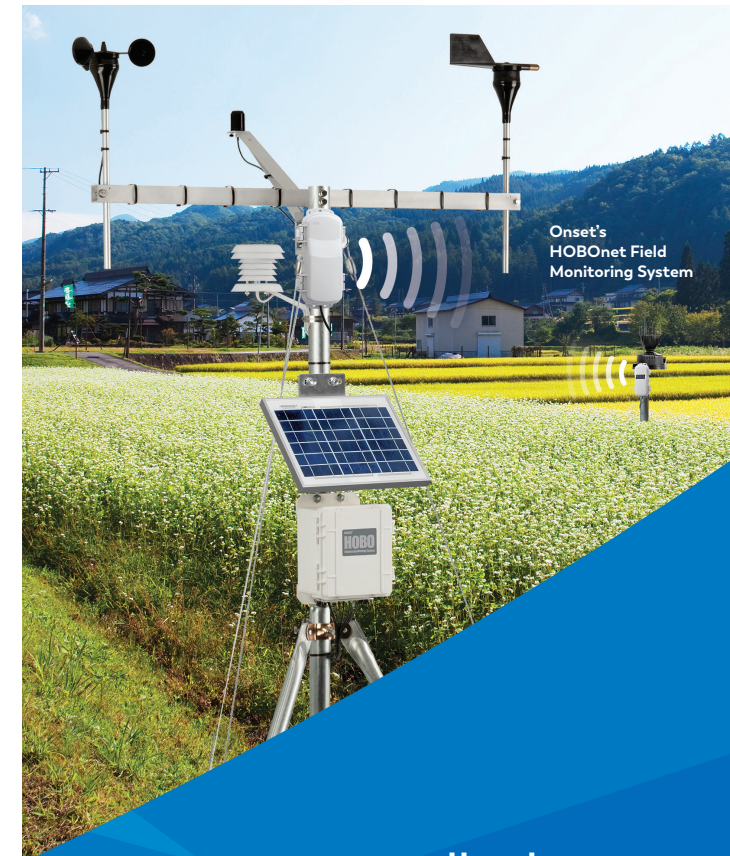
Onset's HOBOnet Field Monitoring System

Network for Environment and Weather Applications